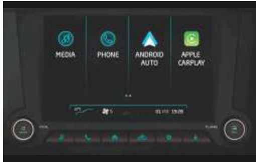
Apple Car Play / Android Auto