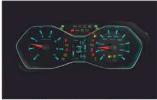
Driver Information System